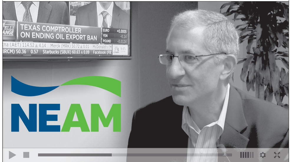
The launch features a new video, "We are New England Asset Management," reintroducing the company to its core constituents and defining how they provide top notch services.