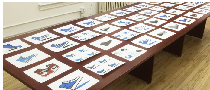
Symbol research involved studying iconic elements of countless sneakers.